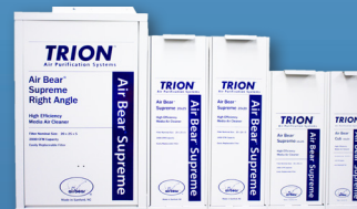
Media Air Cleaners