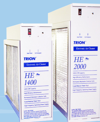
HE Plus 1400 HE Plus 2000

Available in two sizes and capable of cleaning 1,400 to 2,000 cubic feet per minute (CFM), TRION® air cleaners feature a standard, built-in airflow sensor so that the air cleaner is only running when the heating or air conditioning equipment is running to reduce energy consumption.