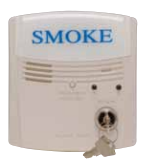
RTS2-AOS UL S2522