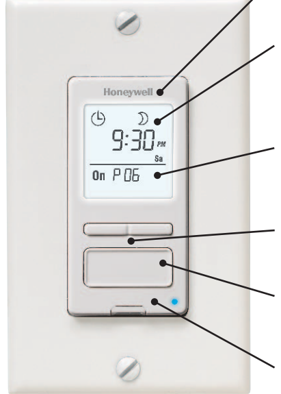
PLS550 / PLS750 Series

# 1 Choice of Homeowners -Honeywell is the leading brand in temperature control.