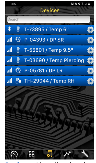
Devices - Lists all probes that are in communication with the app. Select probes to view live data or logs to graph or share.