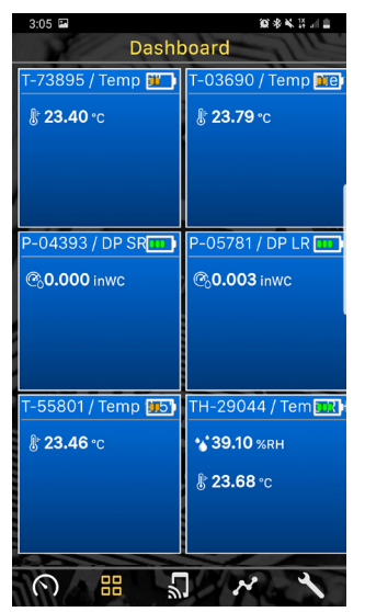
Dashboard - Location where up to 6 probes can be displayed simultaneously with their current readings.