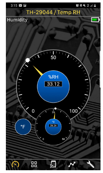
Gauge - Screen where one device can be displayed on a traditional gauge for easy viewing.

Apple and the Apple logo are trademarks of Apple Inc., registered in the U.S. and other countries and regions. App Store is a service mark of Apple Inc. Google Play and the Google Play logo are trademarks of Google LLC.