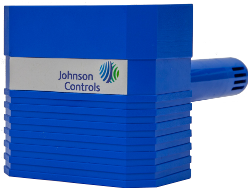
Figure 1: HE-69xx Series Duct Probe Humidity and Temperature Sensor