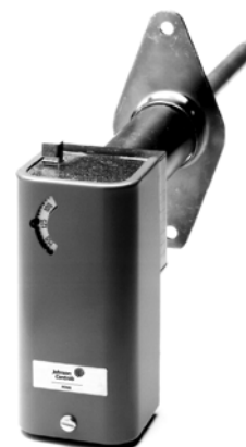
A25AP-1 Warm Air Limit Control