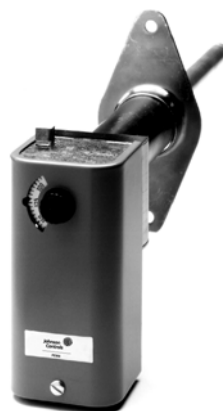
A25AN-1 Warm Air Limit Control