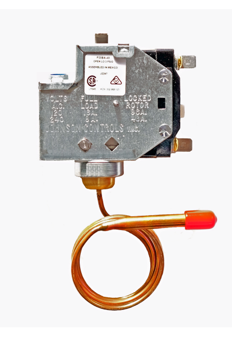
Figure 2: Terminal constructions