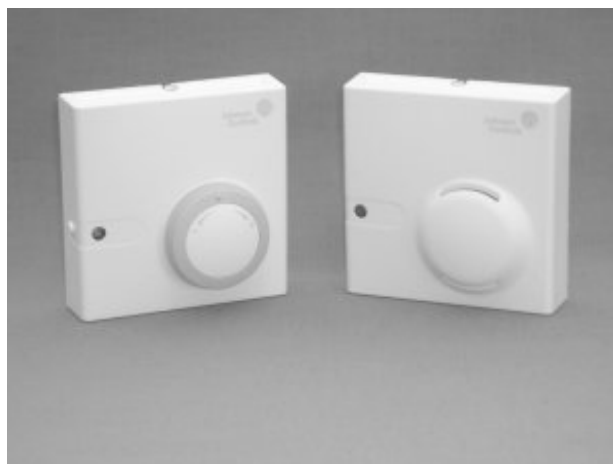
Figure 1: TE-6800 Series Temperature Sensors

Depending on the model chosen, the wires connecting the sensor to the controller can be terminated using a screw terminal block or modular jack connection, offering wiring flexibility. All models include a Zone Bus access port for connecting accessories to access the 6-pin modular jack. This feature allows a technician to commission or service the controller via the sensor.