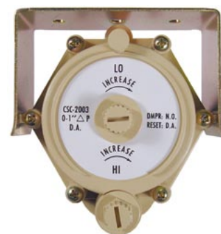
Without Molded Dial