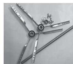
19.25" Overall Diameter (Packaged in pairs with shaft and hardware group.)