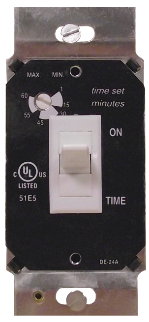
#42517 - White Shown