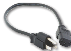
18" Power Cord