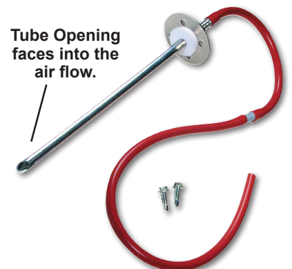
Total Pressure Probe Assembly